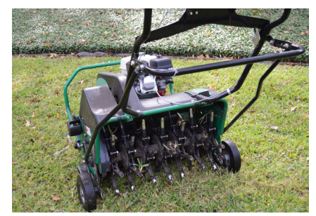
Plug aeration machines are heavy and require strength to move and operate.

Microbial activity also reduces compaction. If you can't afford to aerate your lawn, you can still decrease compaction in two ways. You can either apply compost to your lawn or you can feed the existing microorganisms in your soil to help them to multiply and flourish.