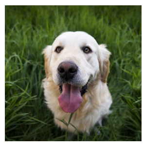
Safer for pets No harmful lawn chemicals

Grow a beautiful resilient lawn that is sustainable and drought tolerant