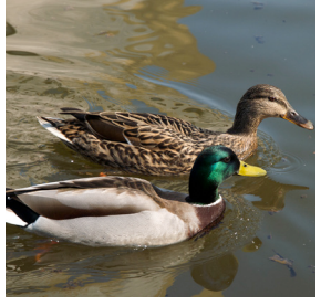
Protect our creeks Prevent chemical run-off

Grow a beautiful resilient lawn that is sustainable and drought tolerant