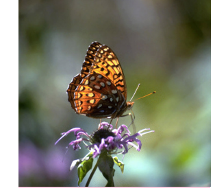
Protect pollinators Provide safe spaces