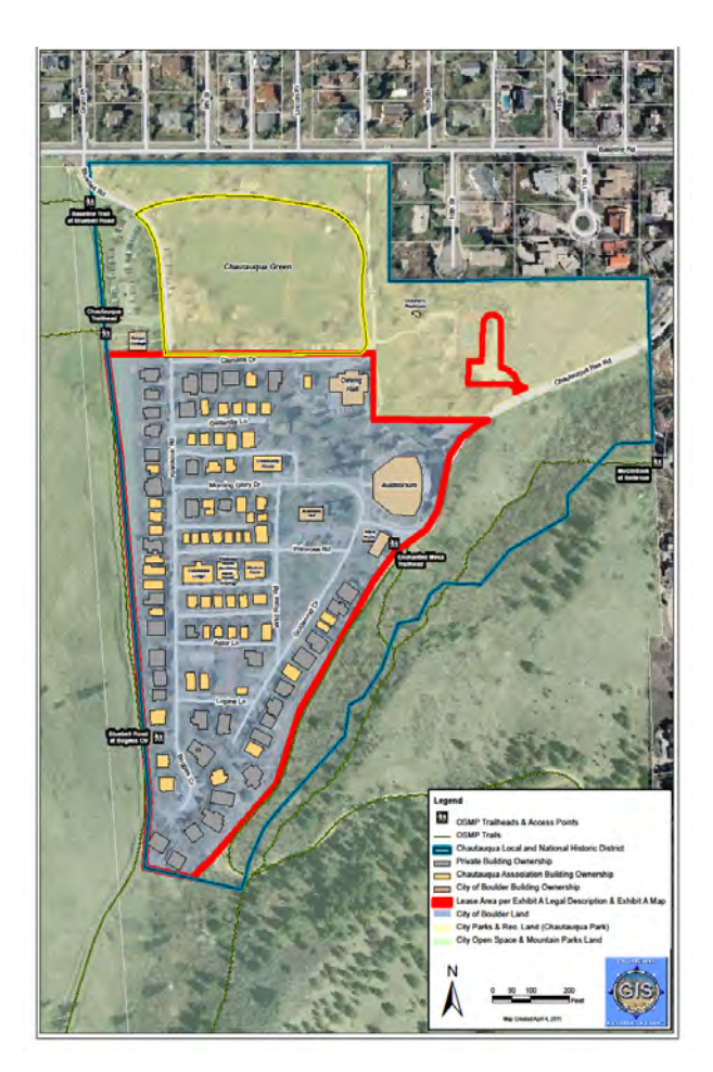
Figure 1: CCA Leasehold (outlined in red)

Manage: to have oversight and responsibility for the on-going affairs and/or the upkeep of a site, property, organization or business.